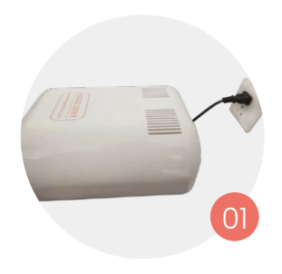
Lay the Light Curing Unit to be horizontal and connect it to power supply