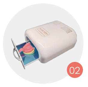
Put the shaped light curing material into the chamber for curing