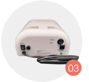
Switch on the Unit, choose the 180s mode, press the button "Start" and wait a moment for curing